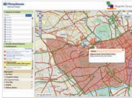
MapInfo Stratus with information callout.

The base maps are entirely configurable to present the user with alternate data sets such as aerial photography or street data.